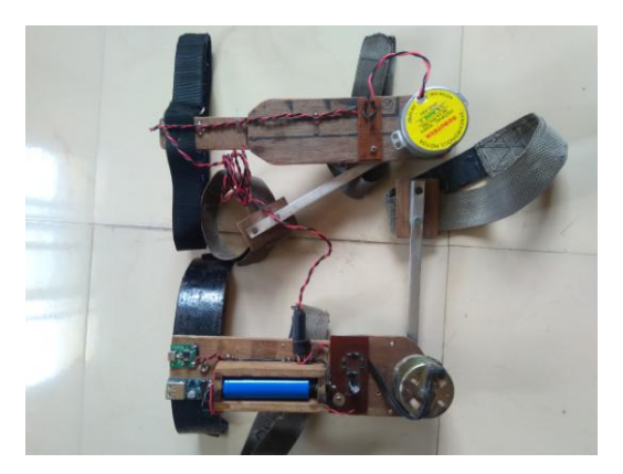
Figure 4 Device itself with harness.