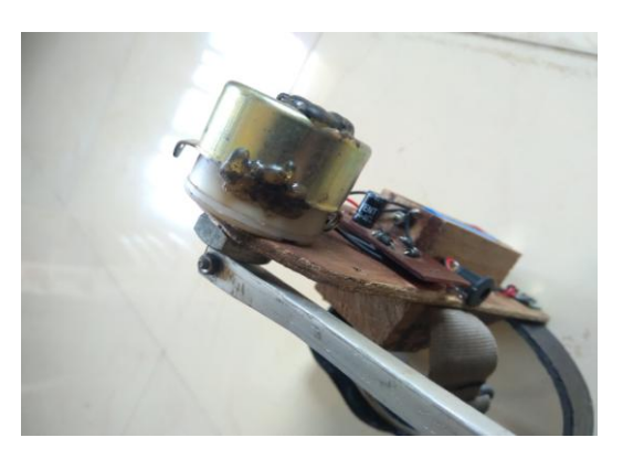
Figure 3 AC motor fused with geared box to work as generator.