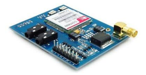
Figure 5: GSM module

GSM module is used to establish communication between a computer and a GSM-G\PRS system. Global System for Mobile Communication(GSM) SIM card is inserted within the mobile device to send and receive the messages