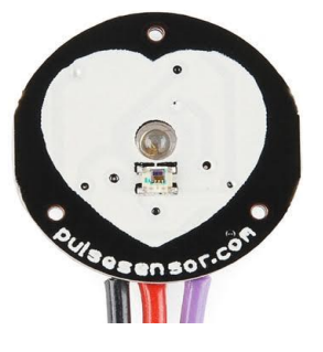
Figure 8: Pulse sensor

It is an RTD(Resistance Temperature Detector) or a thermocouple, that collects the data about temperature from a particular source and converts the data into understandable form for a device or an observer. In this system it senses the body temperature of a person who wears it.