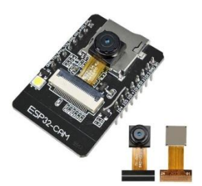
Figure 6: ESP32-CAM

IoTModule(ESP32-CAM) The Internet of things(IoT) has evolved due to convergence of multiple technologies, real-time analytics, machine learning, commodity sensors, and embedded systems the physical world into computer-based systems, and resulting in improved efficiency, accuracy and economic benefit. IoT is that the network of the physical devices, vehicles, buildings and alternative things embedded with physics, software, sensors, actuators and network property that modify to gather and exchange information. The IoT allows objects to be sensed and controlled remotely across existing network infrastructure, creating opportunities for more direct integration. Camera incorporated in this system is used to capture the culprit, it is 5 megapixel camera