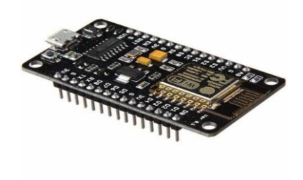
Figure 3: Node MCU(ESP8266)

The block diagramconsists of the following blocks. Battery 12v rechargeable battery is used to power the circuit. Node MCU is the low cost open source IoT platform.Node MCU (ESP8266) is a microcontroller board. Node MCU provides access to the GPIO (General Purpose Input/Output) pins. It consists of 30 input/output pins, 2 UART pins, a 40 MHz crystal oscillator, a USB connection, a power jack, an ICSP header, and a reset button. It contains everything that needto support the microcontroller.support the microcontroller.