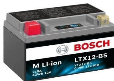
Fig. 3 Lithium ion batteries for Electric bikes

Recycling of lead-acid batteries over other sources such as Li-ion and Ni-Cd are its ease of availability, as well as their lesser expense and the absence in requirement of a battery control pack. Compared to the economical price at which this battery is available it provides the maximum power density in terms of the quantity of energy produced per pound and its long lasting life. Recycling of lead-acid battery can be done at an exceptionally high rate. According to the survey reports it is said that about 97% of these batteries are recycled and can be reused in the making of new batteries [7].