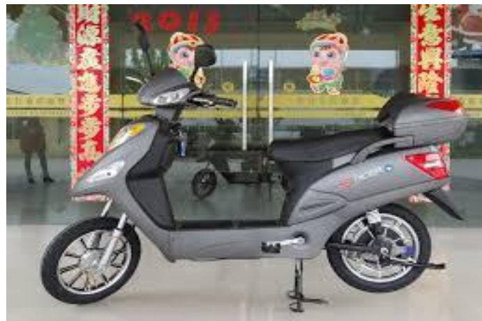
Fig. 1 Pedal system in Electric bikes

The electric consists of 250w,500w,750w 48V/60V geared BLDC rear wheel hub motor, driven by a 48V/60V 20Ah battery pack. The supercapacitor bank consisting of a 16V, 58F to be connected in parallel with the battery pack via a buck boost converter which is designed to harvest the maximum energy from it. Microcontroller circuitry senses various parameters and performs switching and controlling action. The controller is the heart of E-Bike which regulates controlling actions and power through each subsystem. Throttle is a potentiometer box which acts as an accelerator. The Solar Charging module harvests the solar energy and helps to charge electric bikes/electric motorcycles. The Solar Charging Stations utilize solar PV modules to convert solar energy to DC voltage.