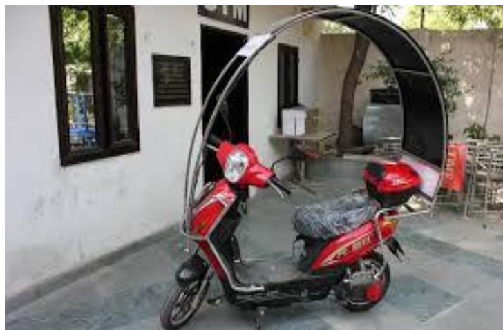
Fig. 2 Solar modules in Electric bikes

receives and regulates the input voltage from PV power source and stores the energy by charging the battery bank [5]. The D.C supply used for the E-bike model is a 48V/60V, 20 Ah battery, lead acid type due to its ease of availability and its low cost. Otherwise one can use two twelve volt batteries of the same ampere hour rating to achieve 48V/60V rating.. The batteries are directly fitted onto the frame of the electric bike and are fixed in place (preferably by locking it onto the frame, or by welding) [3]. The advantage of using lead acid batteries over other source such as Li-ion and Ni-Cd are its ease of availability, as well as their lesser expense and the absence in requirement of a battery control pack. Compared to the economical price at which this battery is available it provides the maximum power density in terms of the quantity of the energy produced per pound and its long lasting life. This kind of acid battery also has huge advantages in terms of environmental protection.