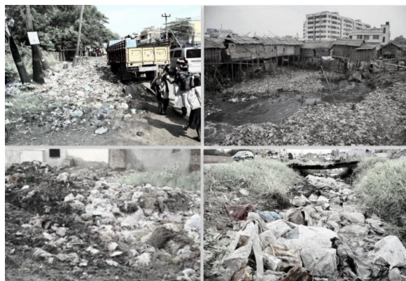
Fig.1 Showing improper disposal of garbage

there is not perfect solution to it. But now the time has come to take up some serious steps so that we can have a garbage clean environment.[1-3]