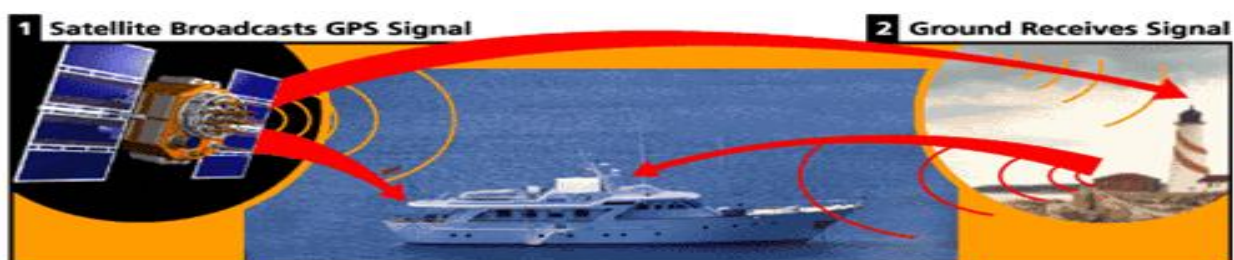
Fig .1 Working of GPS

Civilian GPS uses the L1 frequency of 1575.42 MHz in the UHF band. Fig.1 explains the basic concept of GPS in combat ship. The GPS receiver compares the time a signal was transmitted by a satellite with the time it was received. The time difference tells the GPS receiver how far away the satellite is. Now, with distance measurements from a few more satellites, the receiver can determine the user's position.