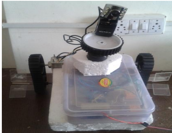
Fig 3.Design model of a proposed system

TTL signal by using converting circuit. L293d is a dual H-Bridge motor driver, so with one IC interface two DC motors can be interfaced. These motors can be controlled in both clockwise and counter clockwise-direction.