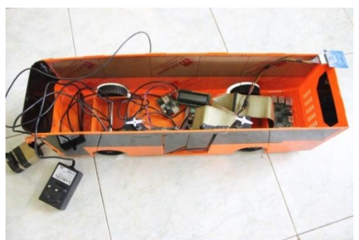
Fig. 3 Implemented system

(An ISO 3297: 2007 Certified Organization) Vol. 4, Issue 4, April 2015