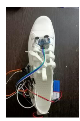
Fig -3: Hardware Kit

The device that we have developed consists of ultrasonic sensors paired with a Vibration motor for sensing the surrounding environment for obstacles and covering the maximum area by the motor. These are integrated into buzzers which give feedback to the user about the position of the nearest obstacles in range. The idea is to make the user independent and protect him/her from potential obstacles which can be fatal for the user. We propose a system consisting of smart shoes. Hardware will be fixed in the user's shoes. When the user wears the shoes and walks somewhere, sensors attached to the hardware will sense obstacles and the Vibration motor will vibrate and buzz for a left/right turn through the path. Through IOT the Data about the Blind person's safety the information will be sent to the Guardian using a MEMS sensor by Wifi Module.