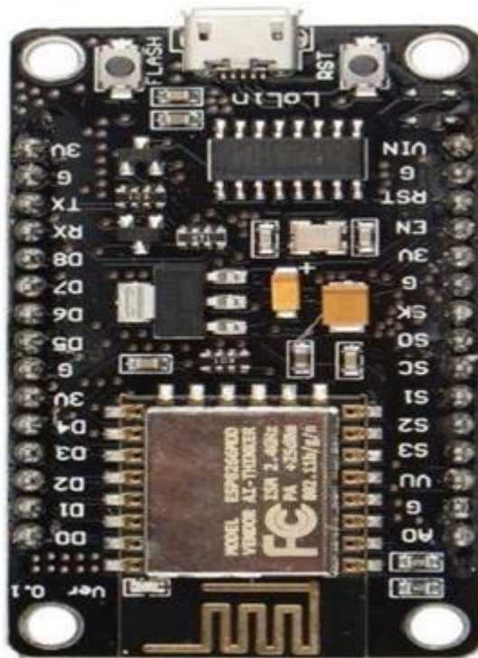
Figure 3: Node MCU