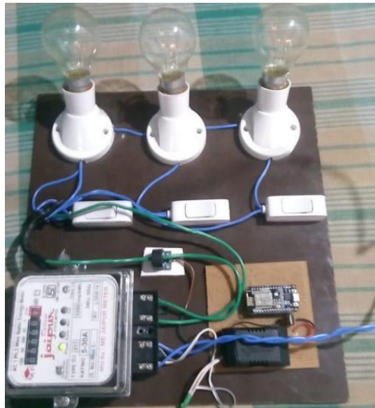
Figure 2: Proposed system