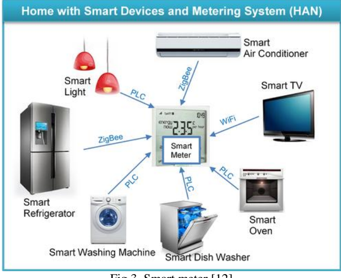
Fig 3. Smart meter [12]

1. The ABT will address this problem by inducing grid discipline.[6]