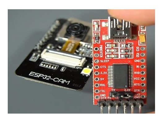
Fig 5 ESP32-CAM with FTDI programmer

The ESP32-CAM is a very small camera module with the ESP32-S chip contains a Micro SD card slot to store images and can display it in browser by creating a webserver.