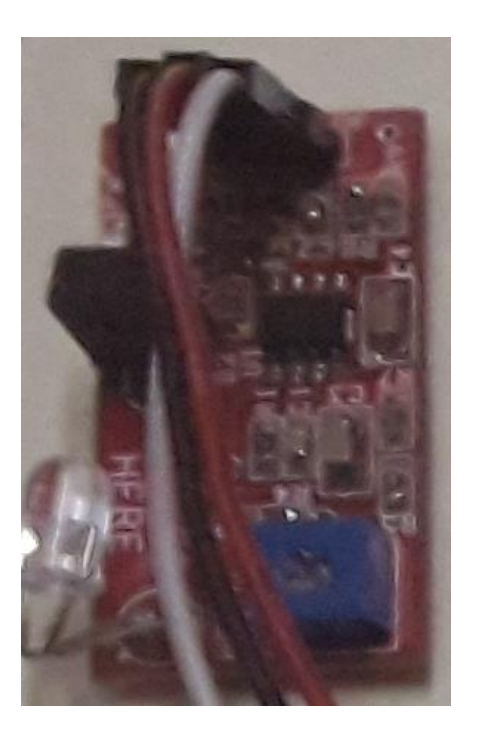
Fig 2 pulse rate and temperature sensor

Looping function has been used to read the temperature and store the value in Fahrenheit then converting it from Fahrenheit to Celsius by multiplying with 0.488.