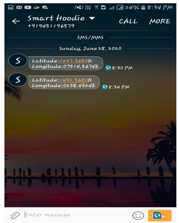
Fig 7 Message received showing location.

The alert message is sent to the respective contacts along with the latitude and longitude position as shown in fig 7 below: