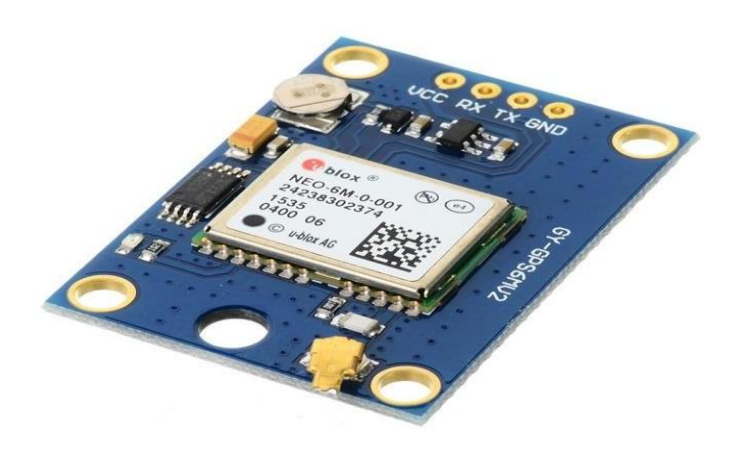
Fig 3 GPS MODULE

The location tracking system is very important in this project, since it is done with the help of GPS module. GPS is a satellite-based navigation system consist of network of 24 satellite located in to orbit. This will update the location of the victim continuously to either the police or the family members. The latitude and longitude of the victim is reported via message service (SMS) at various occurrence and at differenttimes.