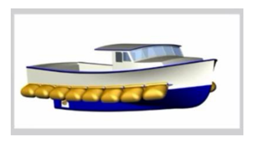
Fig 2: Model of Proposed system