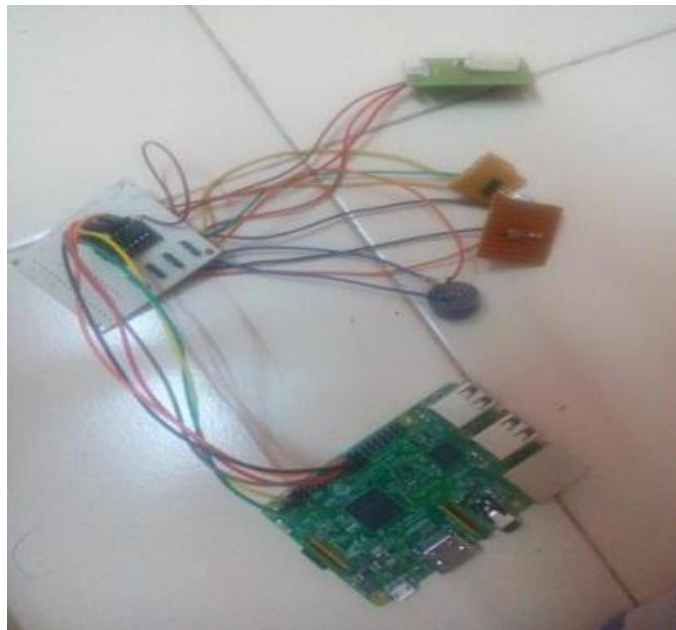
Fig 2-Experimental module

To show the effectiveness of proposed system some experimental results are shown.