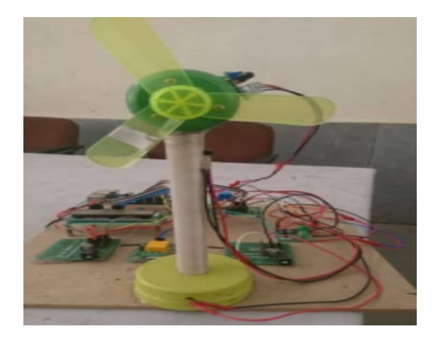
Figure 5: Final Model

The pictures inserted below are the pictorial representations of the project constructed. Final model has the conditional monitoring system and fault detection of wind turbine using sensors. Which is provided with power supply to power all the components of the system.