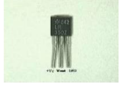
Figure3: Temperature sensor -The LM35.

Once reborn into analog kind the microcontroller will method the digital temperature signal as per the appliance.