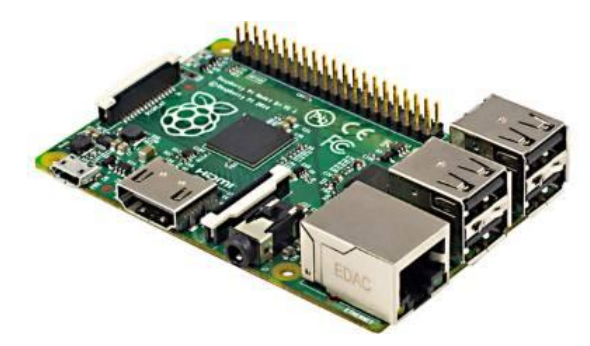
Figure 2: Raspberry pi model.

Raspberry pi: Raspberry pi is a card-sized ARM powered Linux computer development board. T here square measure in total of five forms of numerous board with totally different specification, for the planned meteorology system Raspberry pi to model is employed because the main development board which is shown in Figure 2.