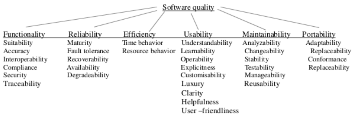
Fig.1. Hierarchical view of ISO 9126 model

These quality factors can be further broken down into lower level quality characteristics, as shown in Fig. 1. The ISO 9126 model consists of 32 software quality characteristics.